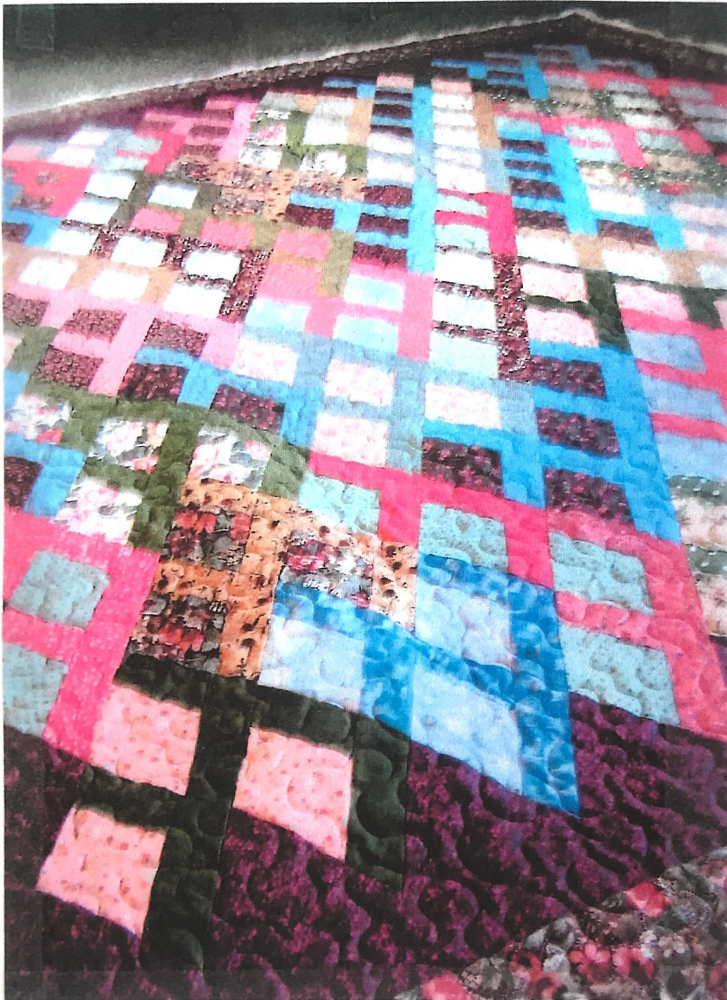
The "Diamond Joy" quilt is a multi-colored scrap quilt. Mostly browns, greens, salmons and blues with a brown backing quilted with an all-over meandering pattern. Measures about 80" x 92".